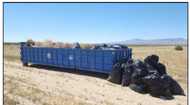
Invasive Weeds removed by volunteers