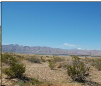
East of Cache Creek: Creosote bushes