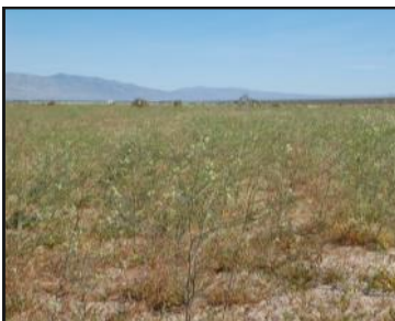
West of Cache Creek: Abundance of non-native plants