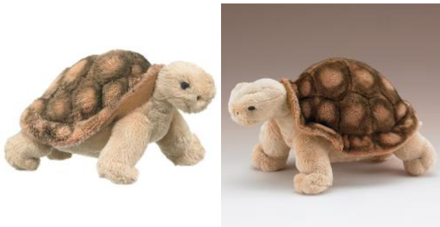
Desert Tortoise Plush 8" & 11"

Additionally, we will be starting a new t-shirt campaign through bonfirefunds.com, featuring our new logo for the DTRNA. The campaign will run from November 3rd to November 24th. Shirts purchased during the campaign would make a great gift and will be shipped in time for the holidays. More information on the campaign will be made available on our website just before the campaign begins.